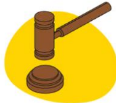
Rule of Law