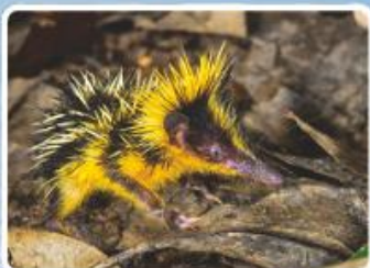
Streaky and Squeaky