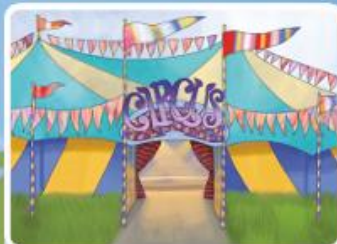
The Girl who Walked on Air